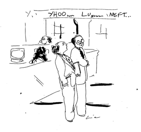
"I may be technically driven, but valuation is still the chauffeur."

From our perspective, the Internet is primarily a very efficient means of communication, following after newspaper, telephone, and television. It is certainly more important to our economy in the long run than tulips were during their day. Yet, true Internet companies are the ones who charge a fee for their subscribers to gain access to the Internet. America Online is one of these, but so are each of the Baby Bells, all the long distance providers, all of the cable companies, the dish companies, the newspapers, Mindspring.com, Internet Direct, Texas Networking, and innumerable other local and regional providers across the country.